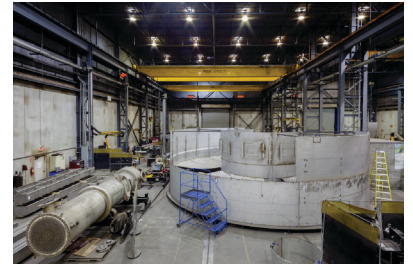
Fabrication of Converter Modules