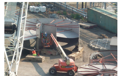
Modular Converter Field Assembly