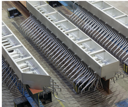
ISO-FLOW® WITH SWIFT-LOCK™ ACID DISTRIBUTOR