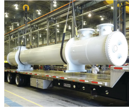
SARAMET® / ANODICALLY PROTECTED ACID COOLER