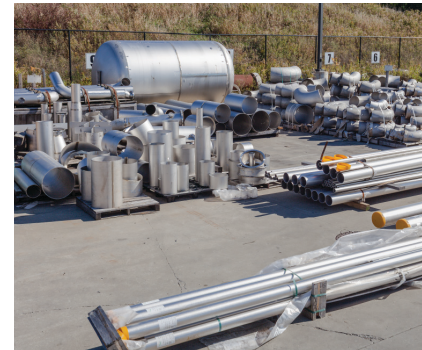
SARAMET® ACID PIPING