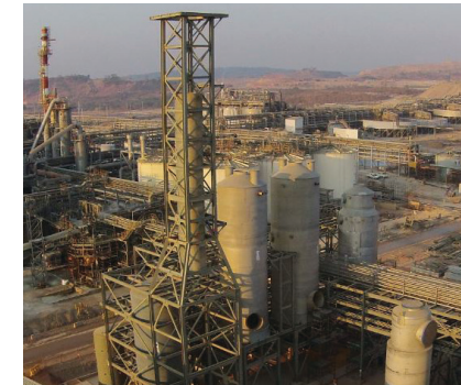
TAIL GAS SCRUBBERS AND BLACKTAIL™