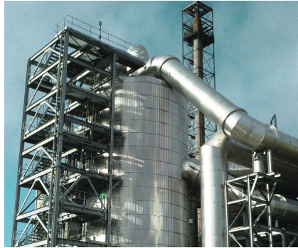
RADIAL FLOW STAINLESS STEEL CONVERTER