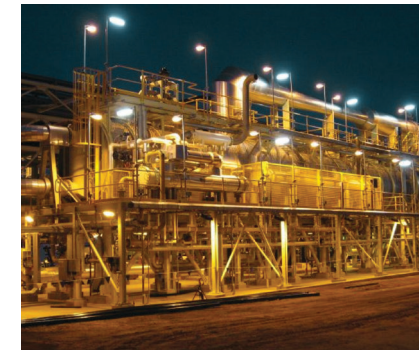
CES-DSW™ DESALINATED WATER HEAT RECOVERY