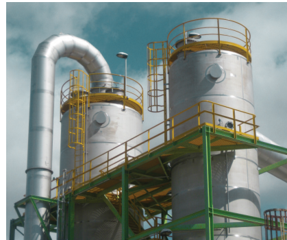
BRICK LINED / SARAMET® ALLOY ACID TOWERS