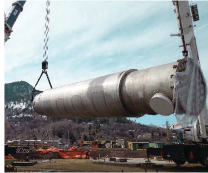
RADIAL FLOW GAS/GAS HEAT EXCHANGER