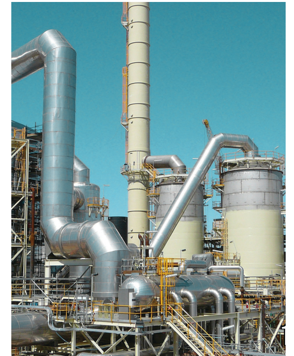
4400 MTPD Sulphur Burning Acid Plant