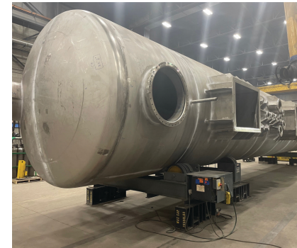
SARAMET® ACID PUMP TANKS