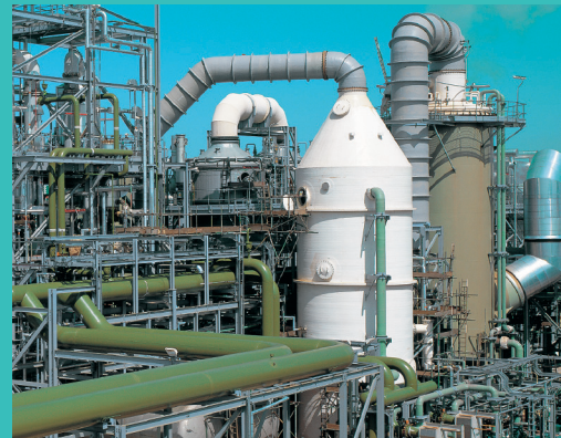
Sulphuric Acid Regeneration Plant

Our standard of excellence in the sulphuric acid industry has been established on a world basis for over 60 years. From our headquarters in Vancouver, BC and our fabrication facility in Pickering, ON, Worley Chemetics (Chemetics®) services customers in the non-ferrous metallurgical, fertilizer and chemical industries around the globe, by providing engineering, equipment and complete turnkey plants for sulphuric acid manufacture and sulphuric acid concentration.